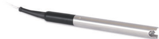
Model 122M P8 Probe

The 122M uses the P8 Probe, which is 5/8" in diameter (16 mm) and stainless steel. It is pressure proof, up to 500 psi. The beam is emitted from within a Hydrex cone-shaped tip. The tip is protected by an integral stainless steel shield, and is excellent for the vast majority of product monitoring situations.