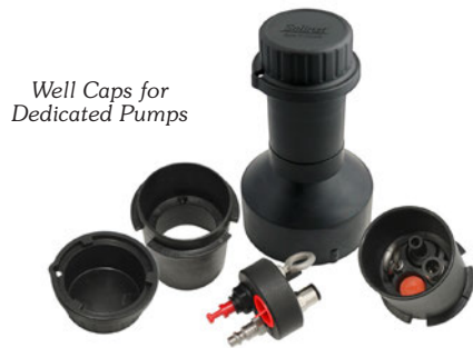
Well Caps for Dedicated Pumps

The DVP is suitable for low flow or regular flow sampling. The stainless steel pumps can operate to depths of 500 ft (150 m).