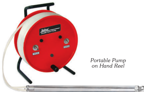
Portable Pump on Hand Reel

For less frequent sampling, reel mounted portable systems allow access to multiple monitoring wells, even in remote locations. The reel mounted portable units are free-standing with a convenient carrying handle. They can be made for almost any size or depth of application.