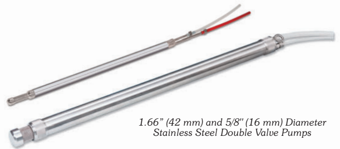
1.66" (42 mm) and 5/8" (16 mm) Diameter Stainless Steel Double Valve Pumps