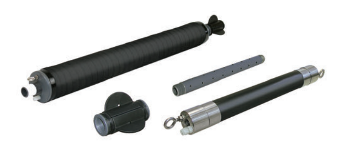
Model 800 Packers 3.9" and 1.8" (99 mm and 46 mm)

Model 800 Low-Pressure Packers can be used with Solinst Bladder Pumps to minimize purge times by reducing purge volumes. This reduces the cost of water disposal and labour. Packers are available in single point or straddle packer designs, and in sizes to fit 2'' (50 mm) to 5'' (127 mm) dia. wells. (See Model 800 Data Sheet.)