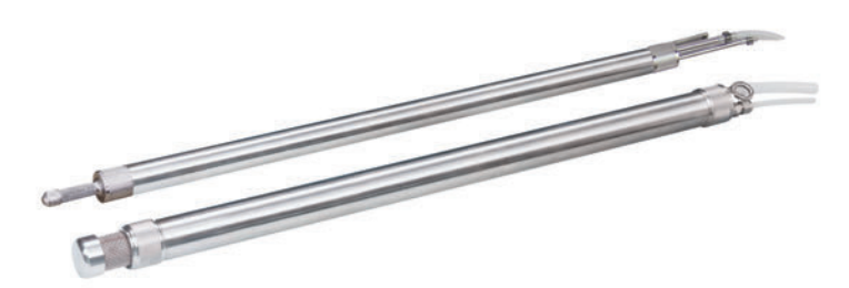
Solinst Bladder Pumps available in Stainless Steel 1" and 1.66" (25 mm and 42 mm).