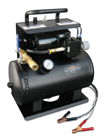
12 Volt Compressor

The compressor operates using 12 volt DC power source, such as a car or truck vehicle battery, and comes with alligator clips. The compressor operates at up to 125 psi and is equipped with a 2 US gallon (7.6 L) air tank which is rated to 150 psi.