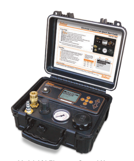
Model 464 Electronic Control Unit (125 psi and 250 psi Models)

The pump is quick to disassemble and the bladders and screens are simple to replace in the field. No tools required. Inexpensive polyethylene bladders can be quickly replaced to suit regulatory requirements.