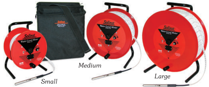
Model 101 Water Level Meter Reels

* Polyethylene tapes are only available in these lengths