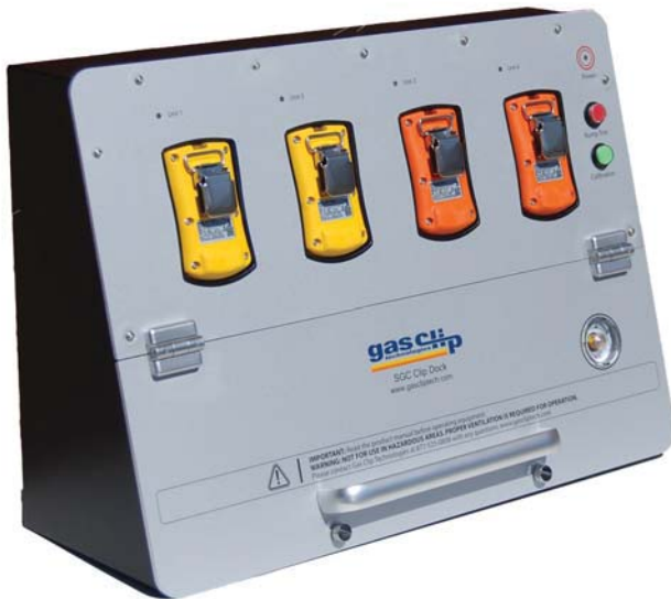
SGC Wall Mount Dock