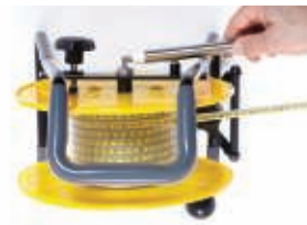
Figure 2 To Test the Entire System: Make sure sensitivity dial is turned fully clockwise. Touch the probe body to the standoff screw and probe tip to the stud (on axle) at the same time. The buzzer will sound if the system is okay.