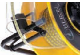
Figure 3 Hanger to support the meter at the well head. Tape Guide to protect the tape from sharp edges.