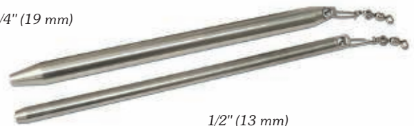
1/2" (13 mm)