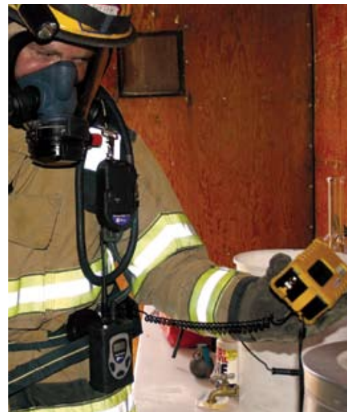
Hazardous Material Response Team member using MultiRAE Plus and GammaRAE II R with RAELink3 Z1