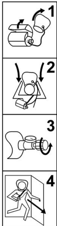
Easy Instructional Pictogram

The QuickAir™ Emergency Escape Breathing Apparatus (EEBA) is NIOSH approved for escape from atmospheres that have become immediately dangerous to life or health (IDLH). The QuickAir™ provides a constant supply of air at 40 liters per minute for 5 or 10-minutes of escape. A 5-minute high flow model that supplies air at 70 lpm is also available. The QuickAir™ can be donned quickly with minimal training, even in the dark. Pictograms that demonstrate how to don the unit serve as convenient reminders on the carrying bag. The QuickAir™ EEBA is user friendly for both left and right handed personnel and can be worn over either shoulder, across the chest or around the neck. The cylinder gauge is clearly visible for easy inspection.