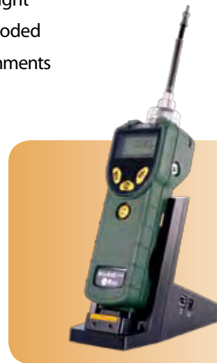
MiniRAE Lite shown in optional Cradle