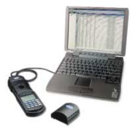
Data Transfer Adapter converts infrared signals from the instrument to standard RS-232 protocol. The adapter fits over the instrument in place of the cap and connects directly to a printer or computer.

Lit. No. 1983 Rev 1 G9 Printed in U.S.A. ©Hach Company, 2009. All rights reserved.