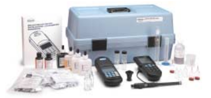
CEL/850 Basic Drinking Water Laboratory