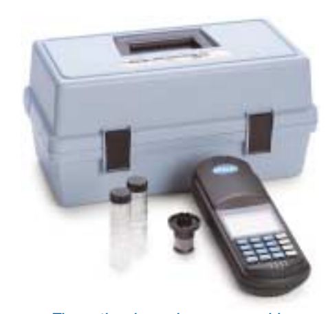
The optional carrying case provides room for the instrument, all accessories, and additional reagent sets.

4966500 HachLink™ Software Package1938004 Alkaline batteries size AA, pk/4